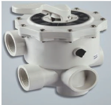
Side Mount Multiport Valve