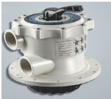
Top Mount Multiport Valve